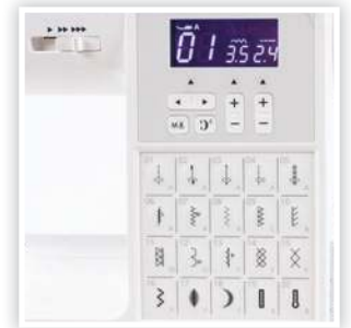
80 ESSENTIAL STITCHES FOR QUILTING AND SEWING