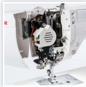
SOLID BUILD FOR SEWING AT HIGH SPEEDS