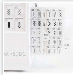
QUICK REFERENCE STITCH CHARTS