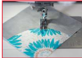
Industrial Inspired HP Foot and Plate