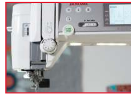
Streamlined Shape and Enhanced Lighting