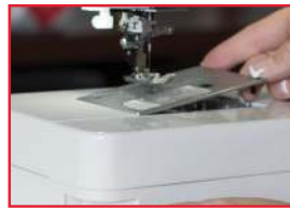
One-Step Needle Plate Conversion