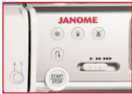
1200 SPM - Fastest Top Loading Bobbin in the Industry