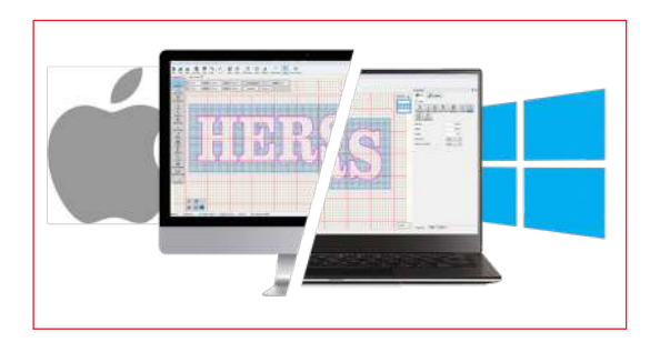
MAC and PC Compatibility with a common user interface