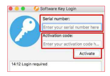
Software key login: Install the software an unlimited number of times, log in to use at any time.